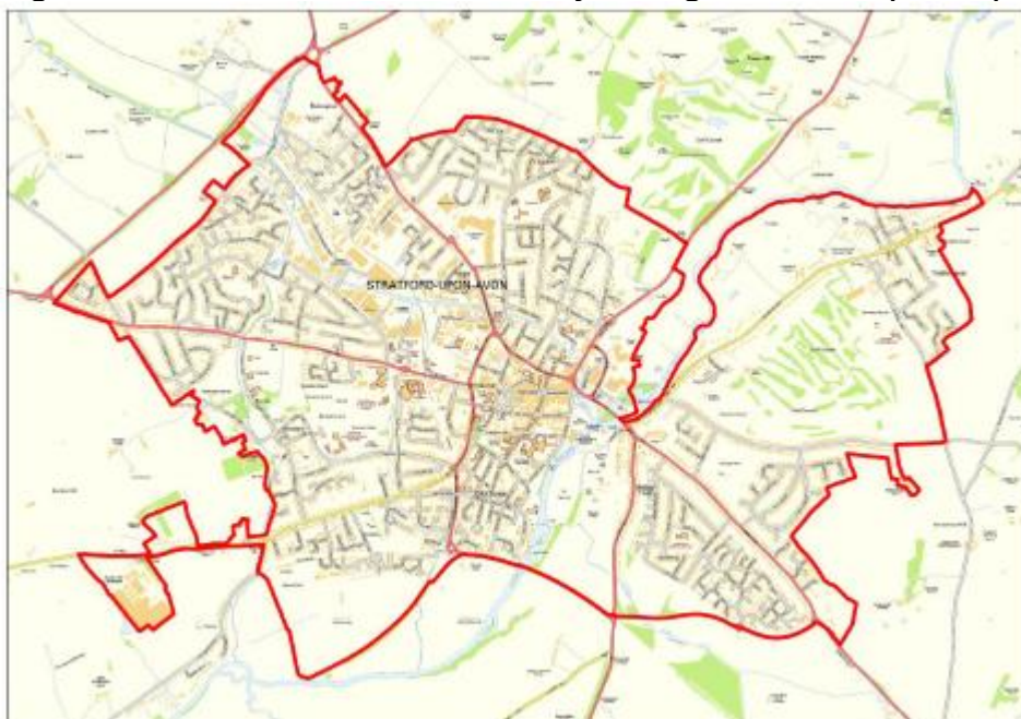
Figure 1: Stratford-on-Avon Air Quality Management Area (AQMA) boundary

Road transport is the main contributor of polluting emissions. Transport infrastructure and behavioural change measures that reduce congestion, improve traffic flows and encourage modal shift to sustainable modes of travel will be key to achieving an acceptable level of air quality in Stratford-upon-Avon whilst providing benefits to public health and the economy. Any development proposals for the town will need to show that air quality will not deteriorate as a result, in line with the Air Quality Strategy in Warwickshire County Council's Local Transport Plan (2011-2026).